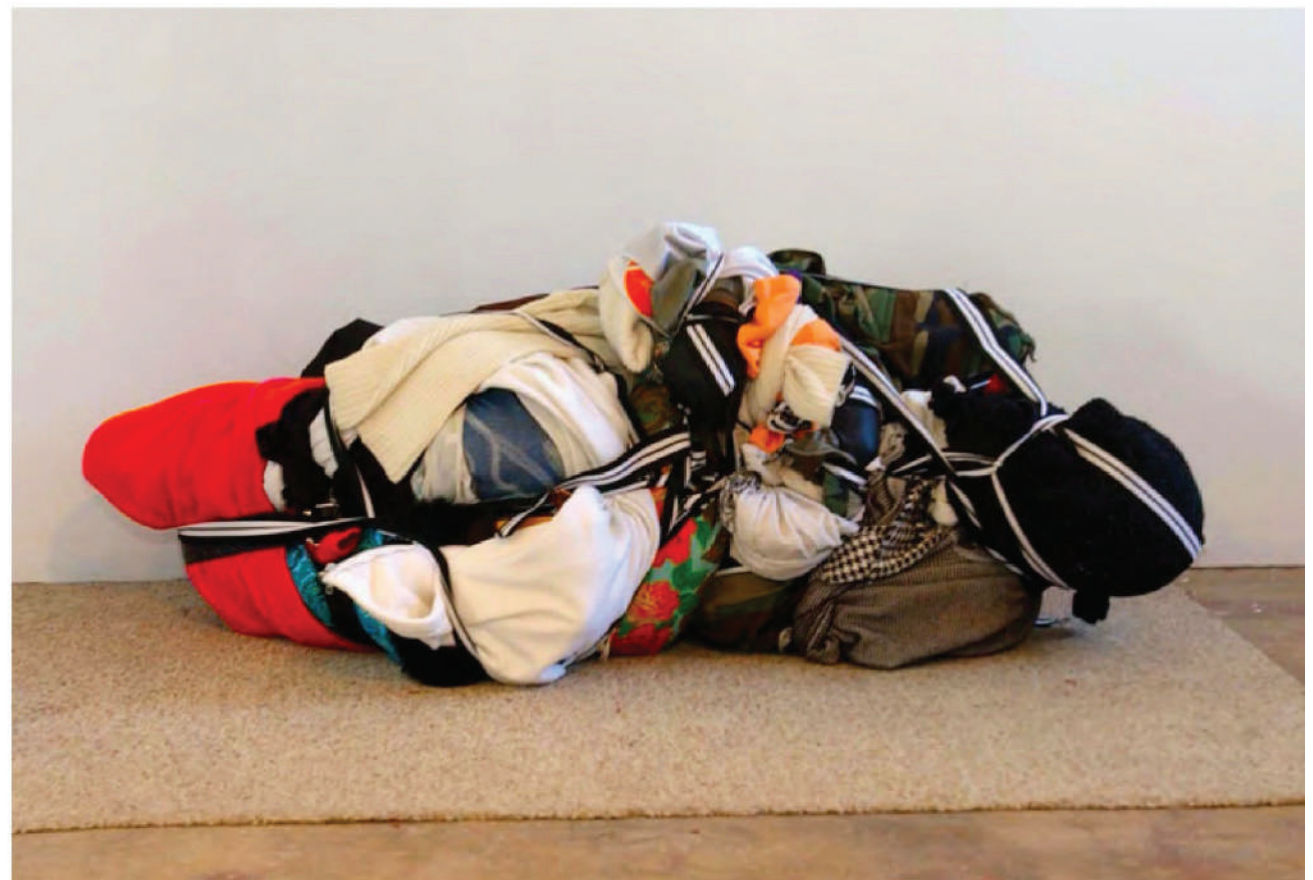
Bundle Me, 2004