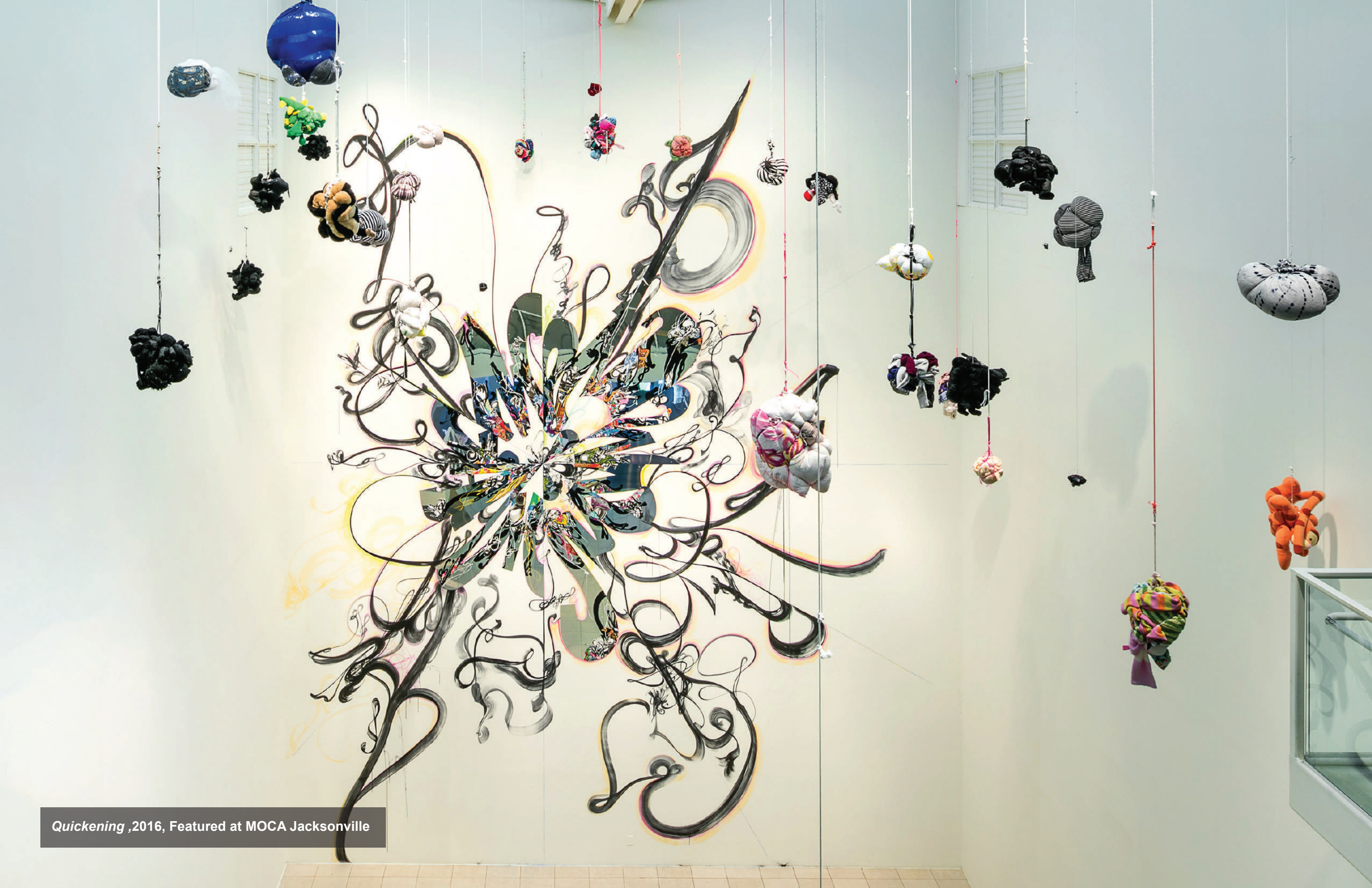
Quickening ,2016, Featured at MOCA Jacksonville