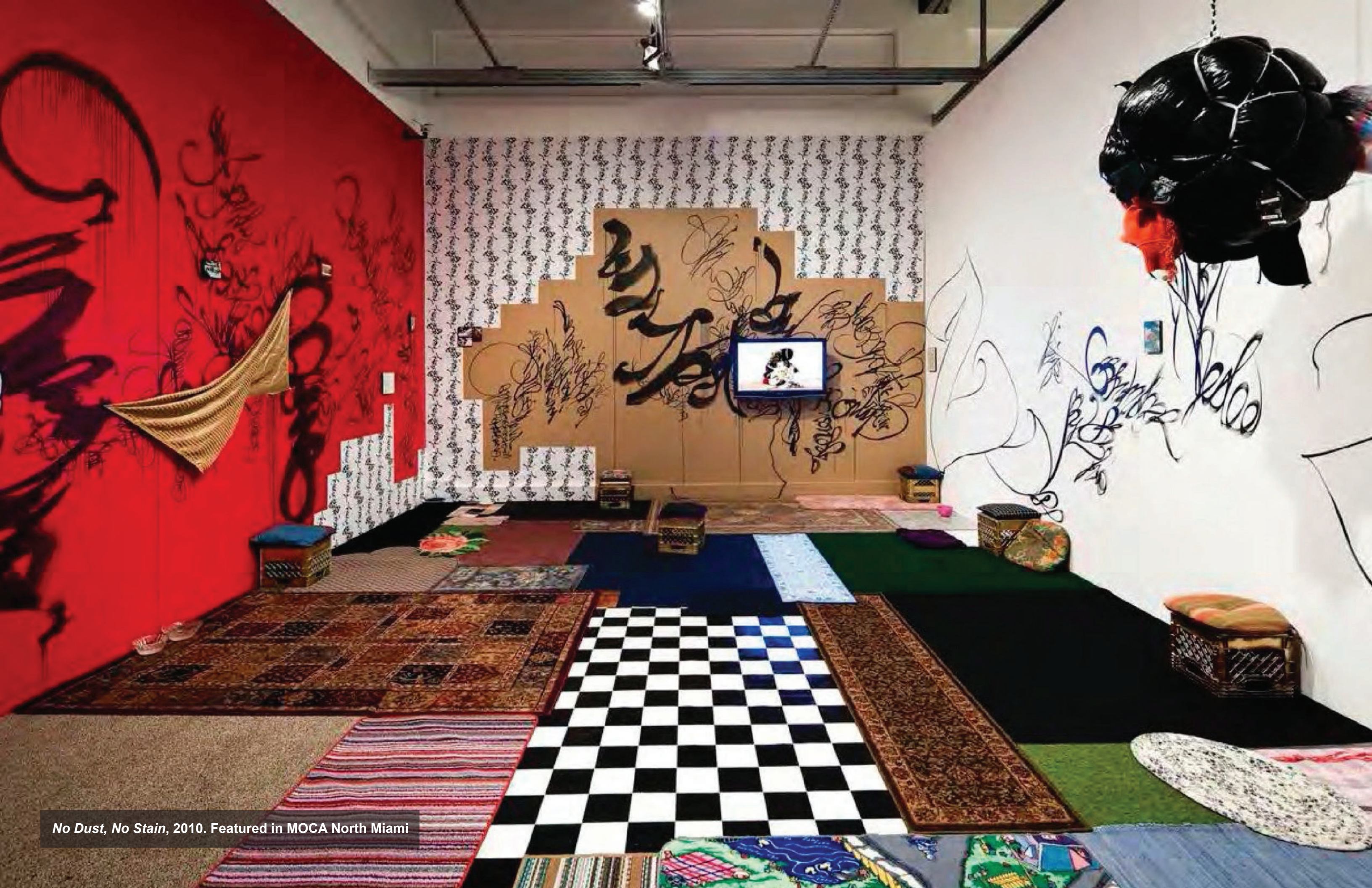
No Dust, No Stain, 2010. Featured in MOCA North Miami