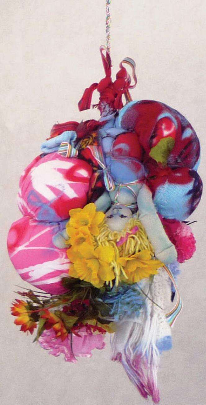
Installation view of Birdhouse of My Soul and Angel , 2011