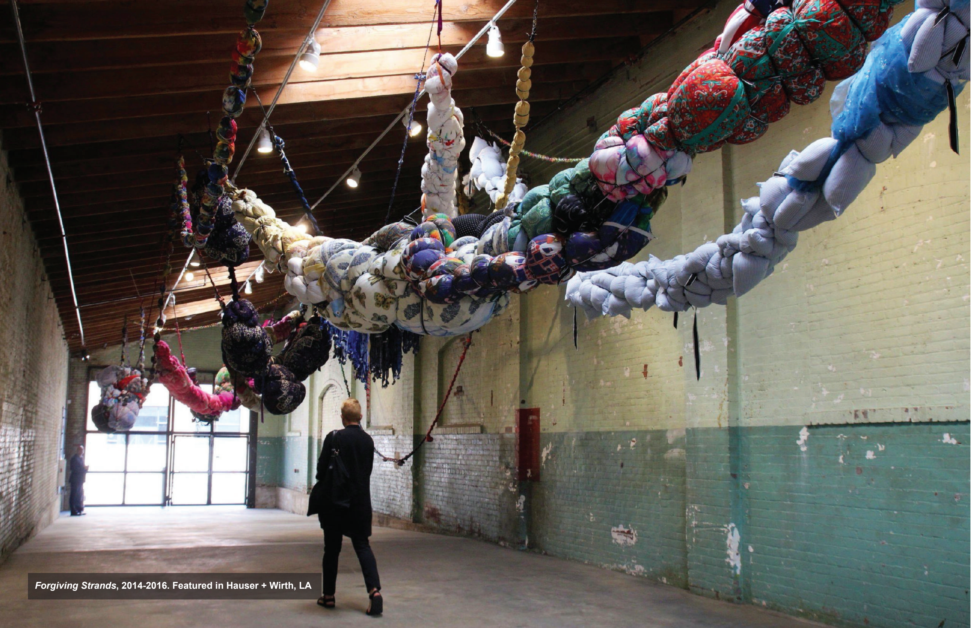
Forgiving Strands, 2014-2016. Featured in Hauser + Wirth, LA