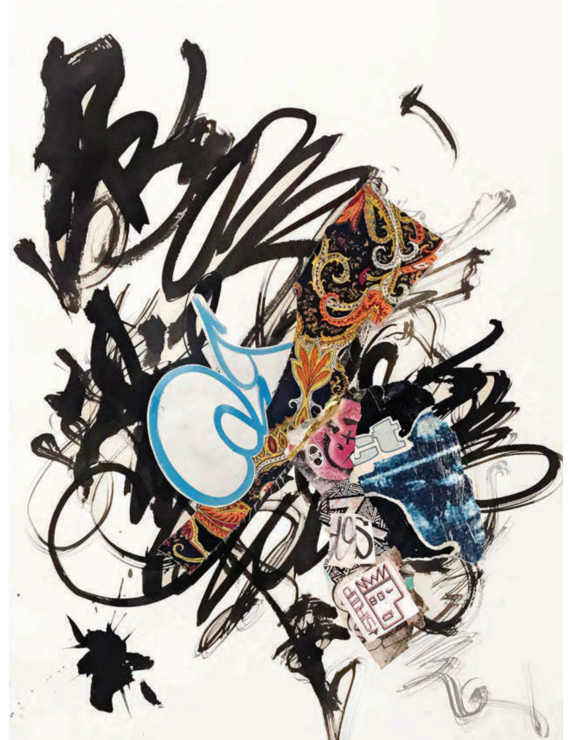
Unruly Again 2019 Ink, acrylic, vintage fabric scraps, and collage on paper 30 x 22 inches