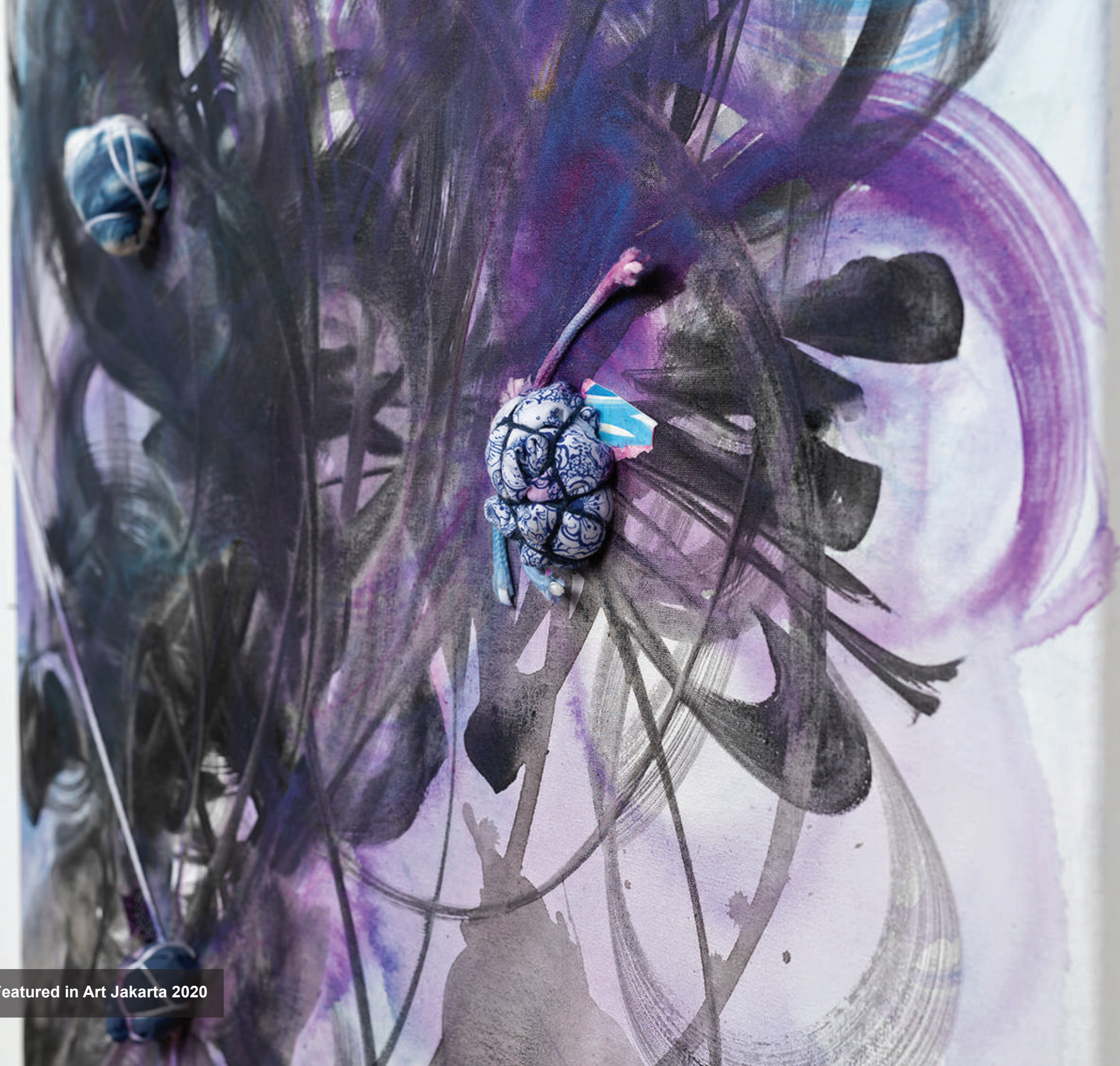
Working Loose , 2020, Featured in Art Jakarta 2020