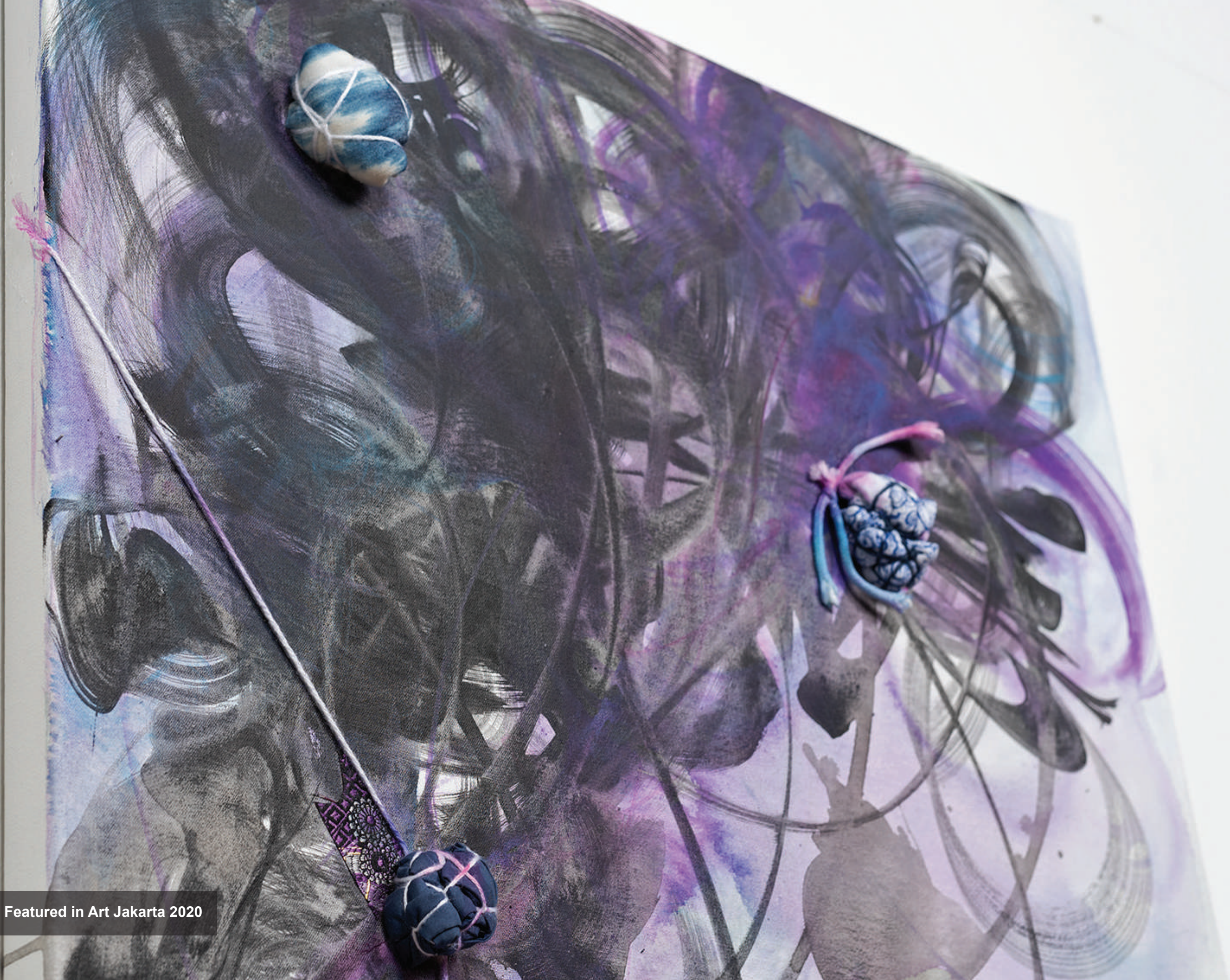
Working Loose , 2020, Featured in Art Jakarta 2020